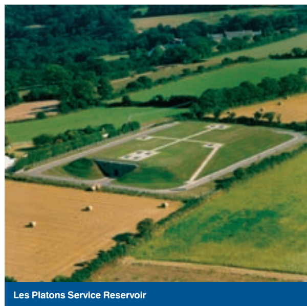
Les Platons Service Reservoir

Five non-compliant analyses were found in samples taken from the supply points and the supply zone during 2008, out of 18,476 analyses taken for compliance purposes. This gives a percentage compliance of 99.97%, slightly up on last years figure of 99.86%.