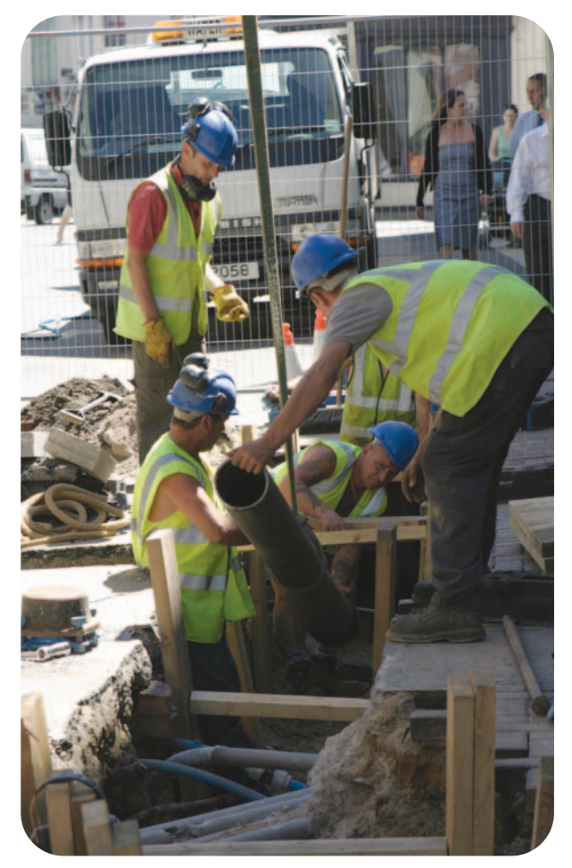
Work undertaken in Union Street

Good progress has been made during the year in converting old manual read water meters to the Electronic Encoded (EE) type meters. These new type of meters can be read electronically and the data is transferred directly into the billing system software, bringing about major savings in meter reading time.