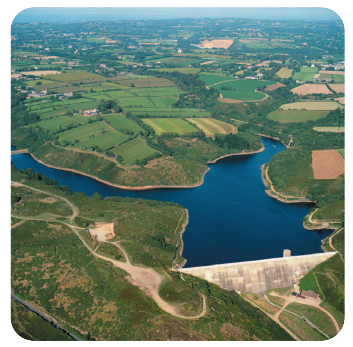
Val de la Mare Reservoir

Further to my comments above and adopting the new dividend policy, your Directors are recommending a final dividend of 255.1 pence per Ordinary and A Ordinary Share (gross), which together with the interim dividend of 3.7 pence per share (gross), makes the total dividend of 258.8 pence per share (gross) for the year.