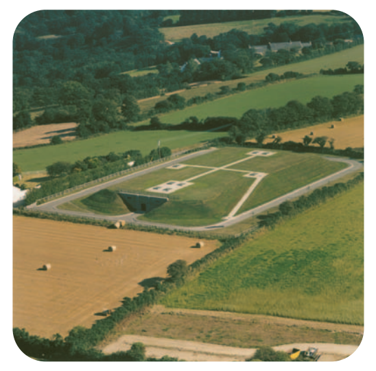
Les Platons Service Reservoir

Shareholders are reminded that the Company has no control over the water catchment areas and the diffuse pollution of water resources from nitrate which is why a dispensation is likely to remain essential. Whilst nitrate levels can be reduced at critical times by dilution with nitrate-free water produced by the desalination plant, this is very expensive and the Company continues to advocate action by the States under