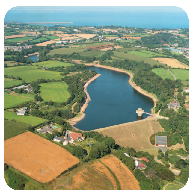
Queen's Valley Reservoir

Due to the significant investment that the Company has made extending and improving the water supply infrastructure for the benefit of our customers and the Island, our shareholders have received little or no return on their