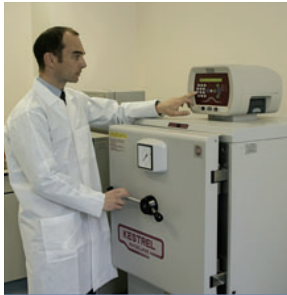
Water Quality Laboratory

The water quality laboratory is a purpose designed facility, consisting of a preparatory room with auto-claves for sterilisation of sample bottles and equipment, a bacteriological laboratory and chemical laboratory. The laboratory uses membrane type technology for bacteriological testing, which is more sensitive than the classic media type analytical process.