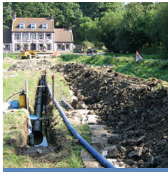
St Peter's Valley - replacement 300mm diameter raw water transfer main and new 90mm diameter treated water main