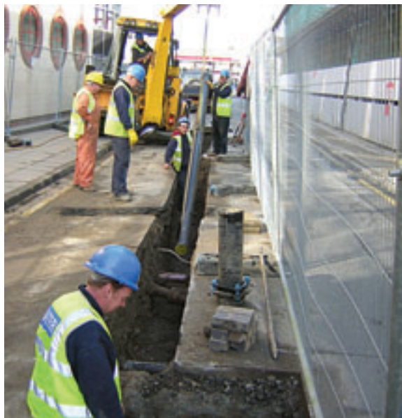
Laying of a replacement 150mm diameter water main in St Helier

During 2005, 191 samples from new and replacement water mains were taken for analysis.