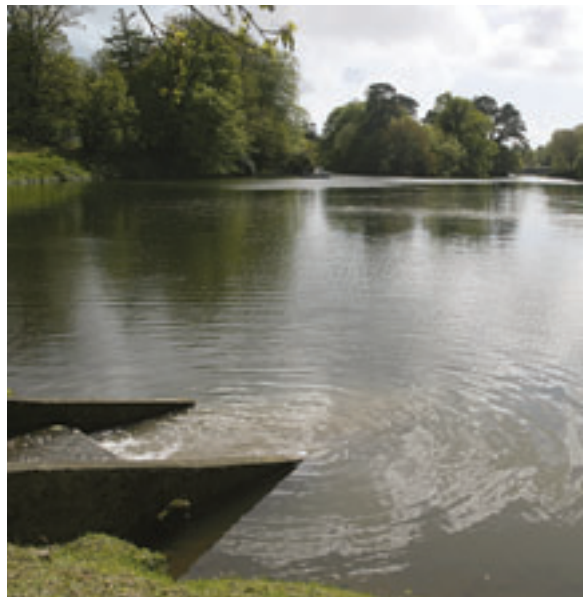
Handois Raw Water Storage Reservoir