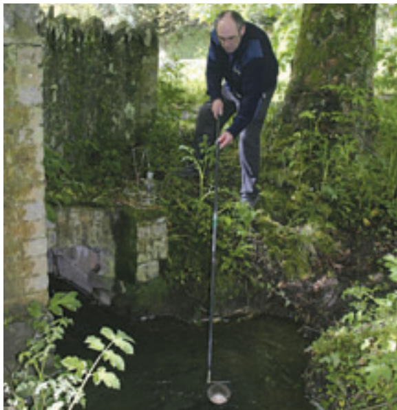
Raw water sample collection

During 2005, 908 water samples were taken from stream sources and analysed for physical, bacteriological and chemical parameters. There were 24 herbicides and pesticides detected in water samples taken from the streams.