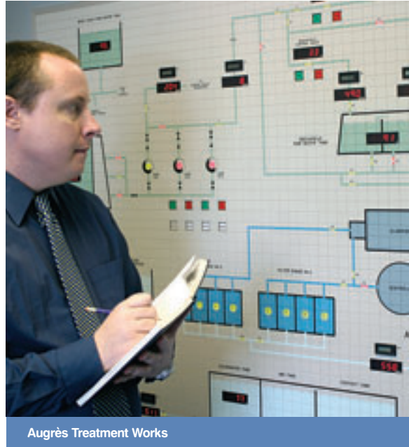
Augrès Treatment Works

Twenty nine non-compliant analyses were found in samples taken from the supply points and the supply zone during 2005, out of 18,388 analyses taken for compliance purposes. This gives a percentage compliance of 99.84%, slightly up on last years figure of 99.81%.