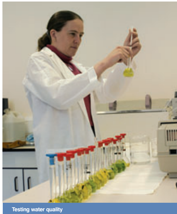
Testing water quality

Jersey Water plans further investment in the renewal of old water pipes in future years.