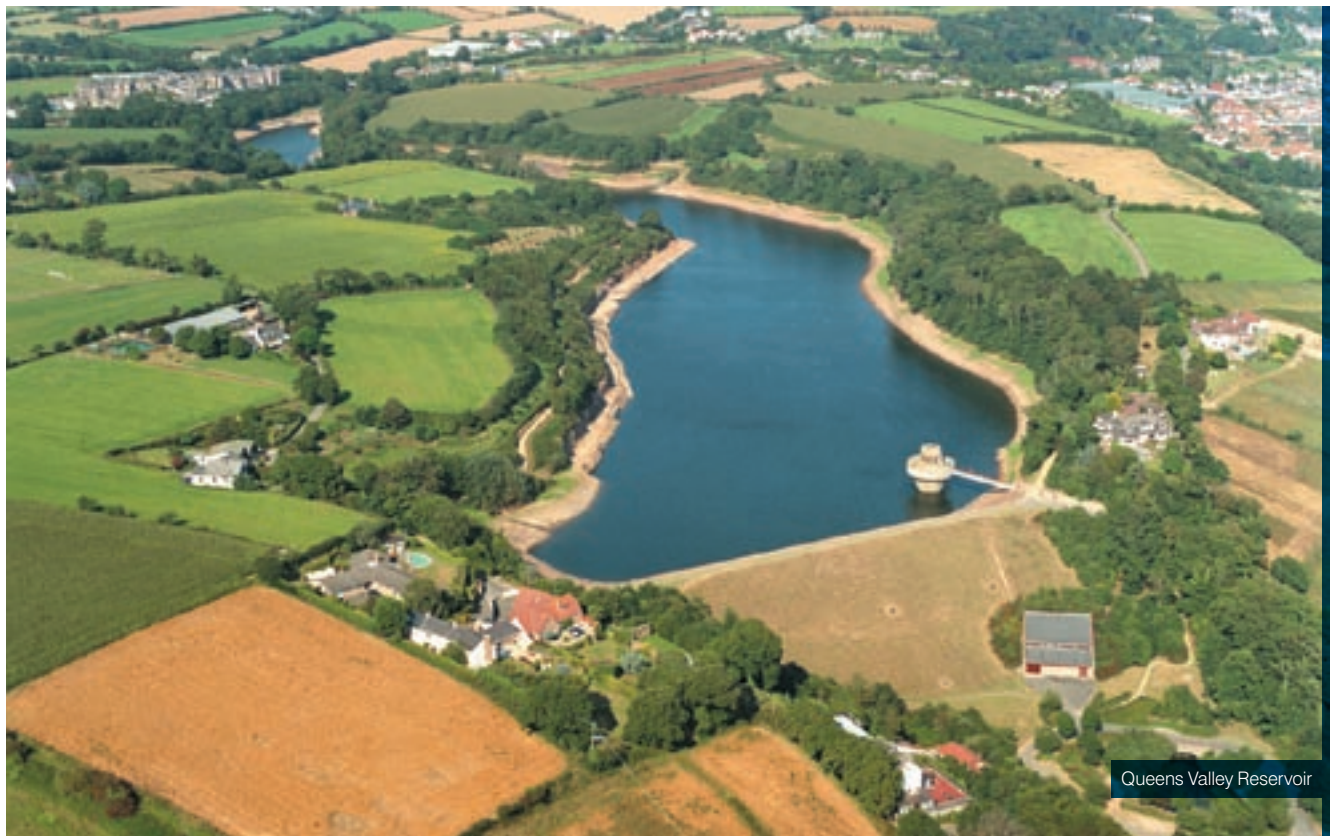
Queens Valley Reservoir

For operational and monitoring purposes Jersey Water takes samples of water from streams and reservoirs.