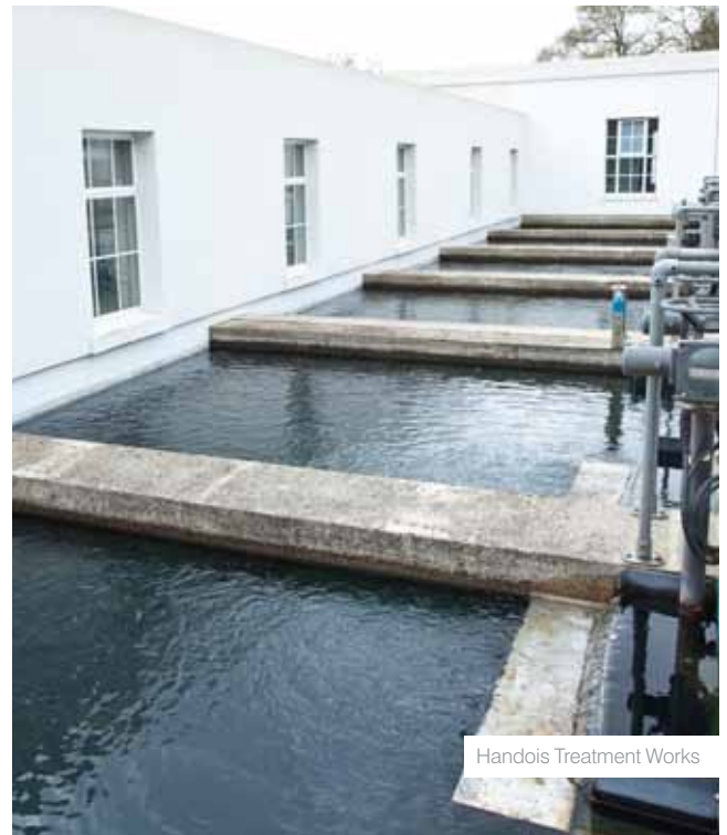
Handois Treatment Works

There were 2 non-compliant analyses detected in 2012 out of the 15,321 analyses taken for compliance purposes, giving a percentage compliance of 99.99% - our best ever result. The following table shows the percentage compliance in treated water for 2012 and the previous four years.