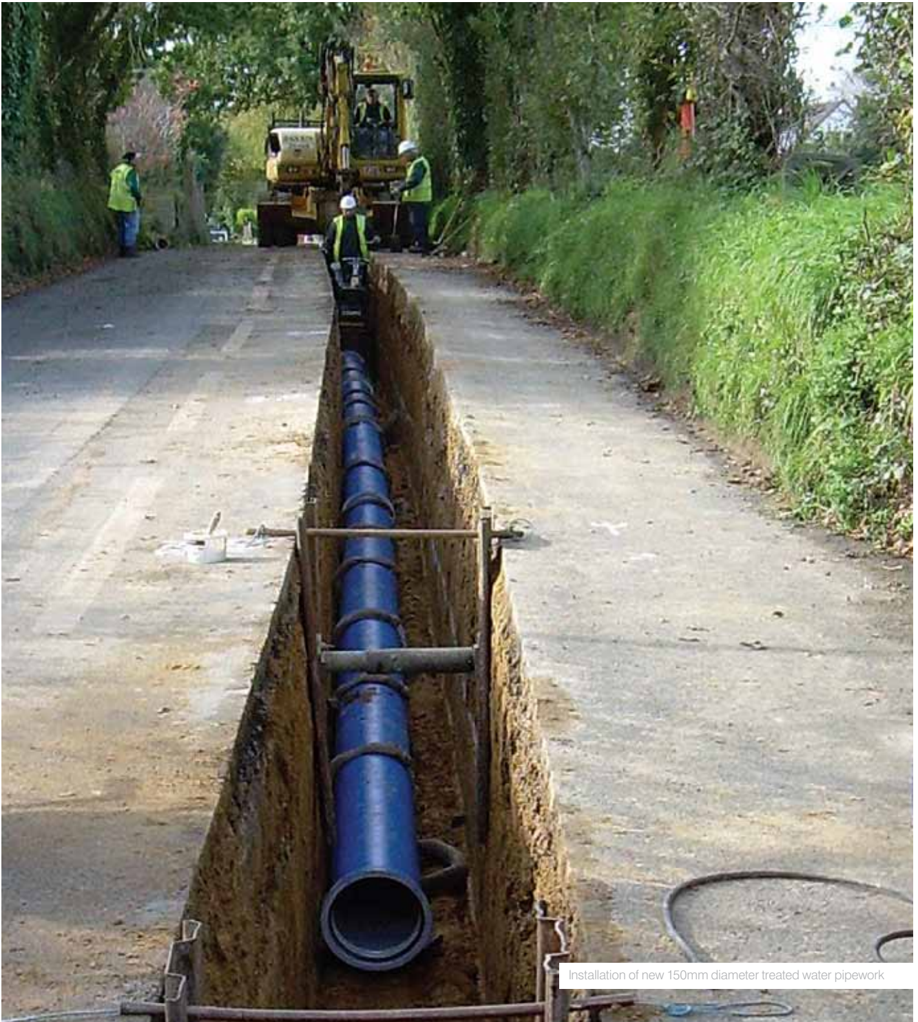
Installation of new 150mm diameter treated water pipework

In 2012 some 147 samples were taken from new and replacement treated water mains.